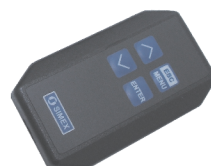
IR remote controller SIR-15