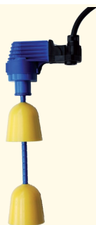
MAC3 Agma W $ 32.00