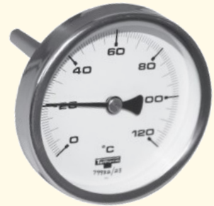
Bi-metal Thermometer Teltherm 3CC $ 65.00