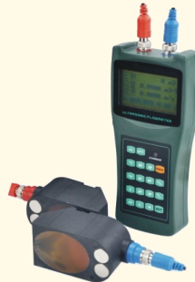
Handheld Ultrasonic Flowmeter $1,800.00